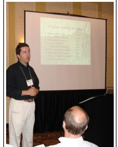
"Mapping C.E." Report